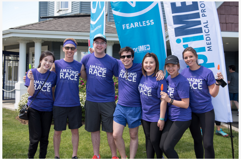
priMED Amazing Race Team Building Event