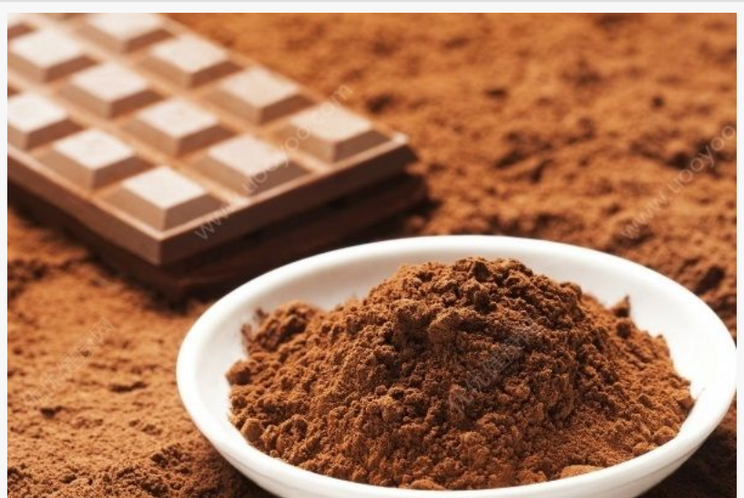
From Cacao to Chocolate - How Chocolate Is Made?

The primary components of chocolate are cocoa beans, sugar or other sweeteners, flavoring agents, and sometimes potassium carbonate (the agent used to make so-called dutch cocoa).