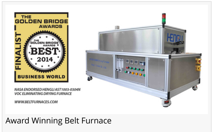
Award Winning Belt Furnace

The next step is refining, during which the liquor is further ground between sets of revolving metal drums. The widely-used machine is roll mill (2 or 3 rolls). It has been recorded that the three roll mill was used to mill chocolate as early as 1915. Each successive rolling is faster than the preceding one because the liquor is becoming smoother and flows easier. The ultimate goal is to reduce the size of the particles in the liquor to about .001 inch (.00254 centimeters).