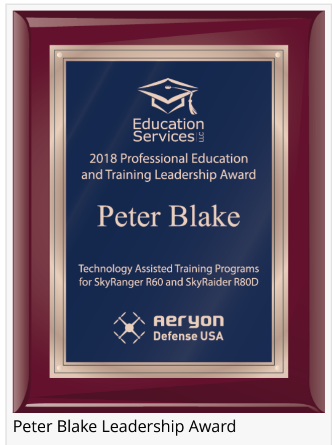
Peter Blake Leadership Award

The online training system also includes support for instructors by housing training guides and classroom presentation materials, helping to ensure that all trainees benefit from a consistently high-quality experience