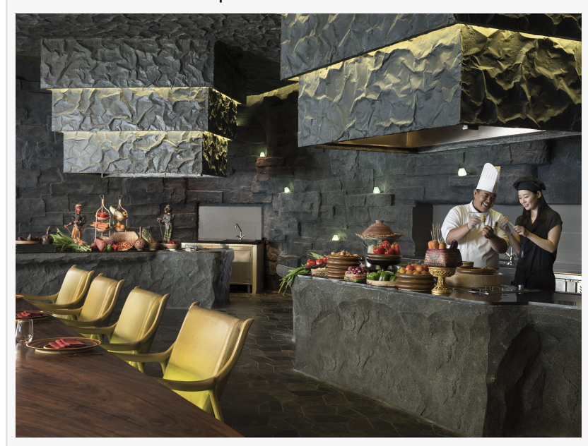
Balinese Cooking Class