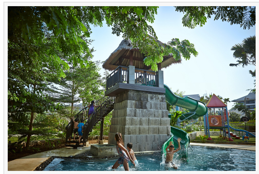
Ritz Kids dedicated kids pool

About The Ritz-Carlton, Bali. Located on a stunning beachfront combining with a dramatic clifftop setting, The Ritz-Carlton, Bali is a luxurious resort offering an elegant tropical ambience. Featuring tranquil views over the azure waters of the Indian Ocean the resort has 279 spacious suites and 34 expansive best <u>villas in Bali</u>, providing the sheerest of contemporary Balinese luxury. Along the foreshore are The Ritz-Carlton Club<sup>®</sup>, six stylish dining venues, an indulgent and exotic marine-inspired Spa, and fun, recreational activities for children of all ages at Ritz Kids. A glamorous beachfront wedding chapel, makes an idyllic setting for destination weddings, while a range of outdoor event venue and extravagant spaces provide the perfect scene for celebratory events and wedding reception in Bali. Well-appointed conference venues, luxurious meeting