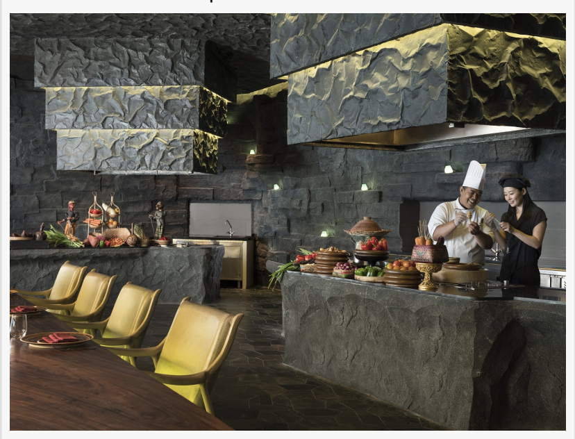
Balinese Cooking Class