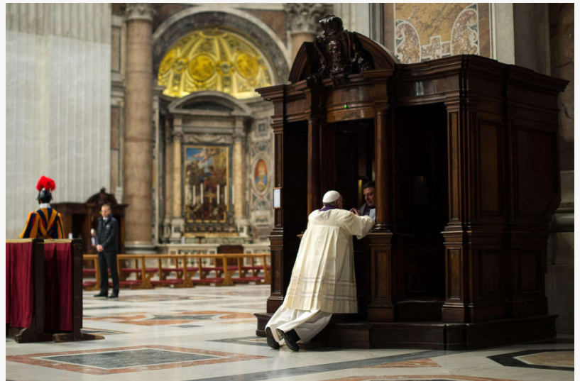
Confession at the Vatican