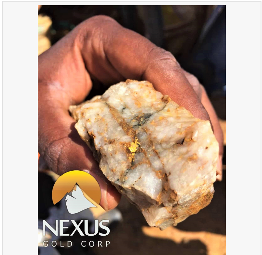
Figure 1 Visible gold in quartz sample recovered at the Dakouli 2 concession, November 2018