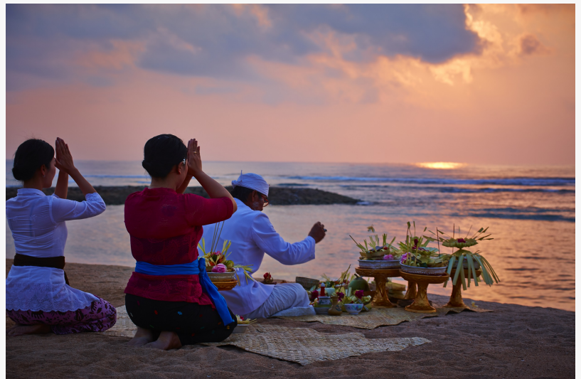
00 00 00