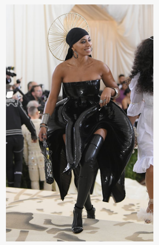
Why everyone is talking about Solange Knowles's Met Gala bag.