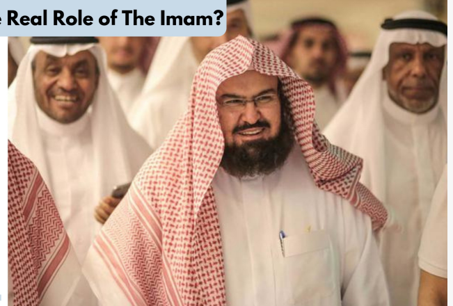
What's The Real Role of The Imam