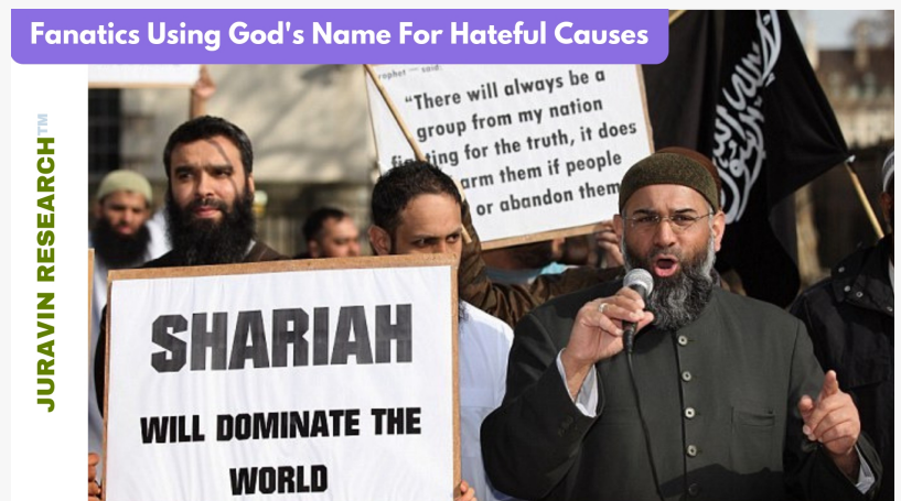
Fanatics Using God's Name For Hateful Causes