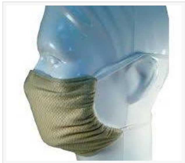
Global Disposable and Reusable Masks Market

sectors in this region, which may bring huge air pollution.