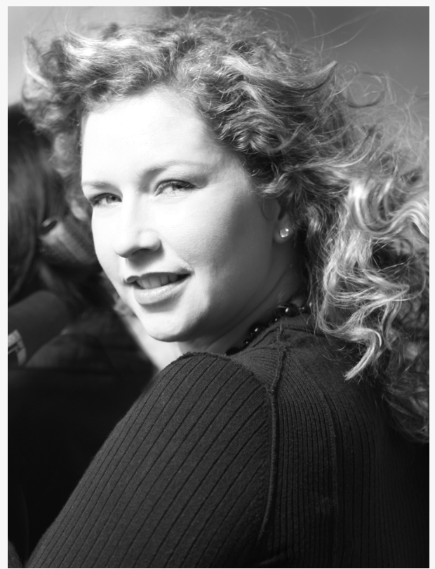
Intuition Salon and Spa: Natural and Organic Hair Care

Dawn Shannon Intuition Salon & Spa +1 727-443-2927 email us here