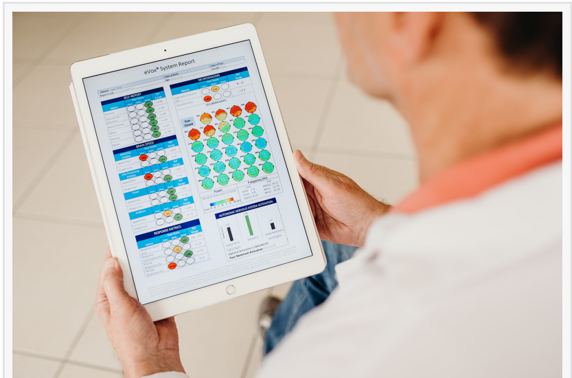
eVox measures objective and stable brain-based biomarkers

Evoke boasts an impressive portfolio, including an FDA cleared diagnostic device, a Veterans Health Administration FSS contract, well-established insurance reimbursement coding (5 CPT codes), a recently renewed Premier Group Purchase Organization contract, 12 patents awarded (9 Utility, 3 Design), delivery of over 400 eVox Systems to market, and ownership of nearly 50,000 patient brain scans to be used for training AI models.