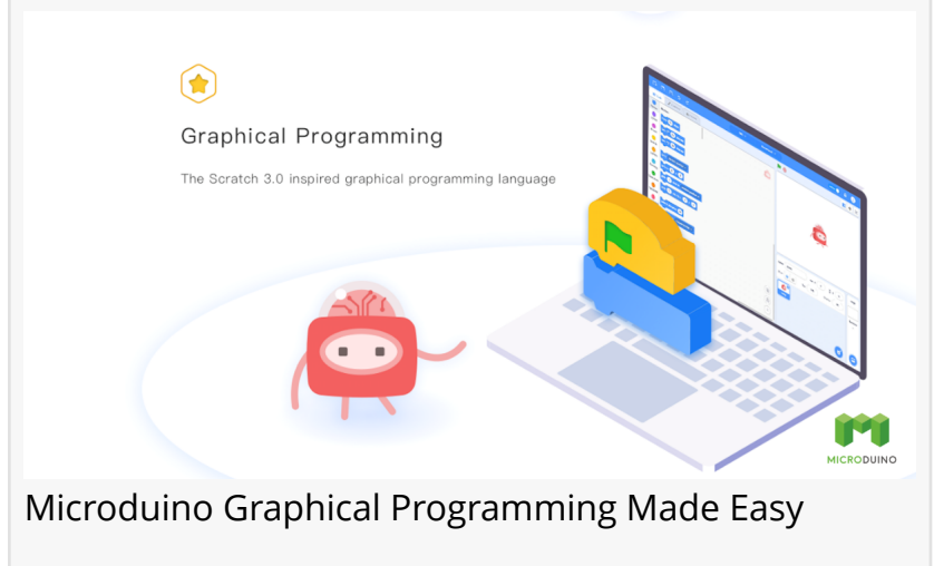
Microduino Graphical Programming Made Easy