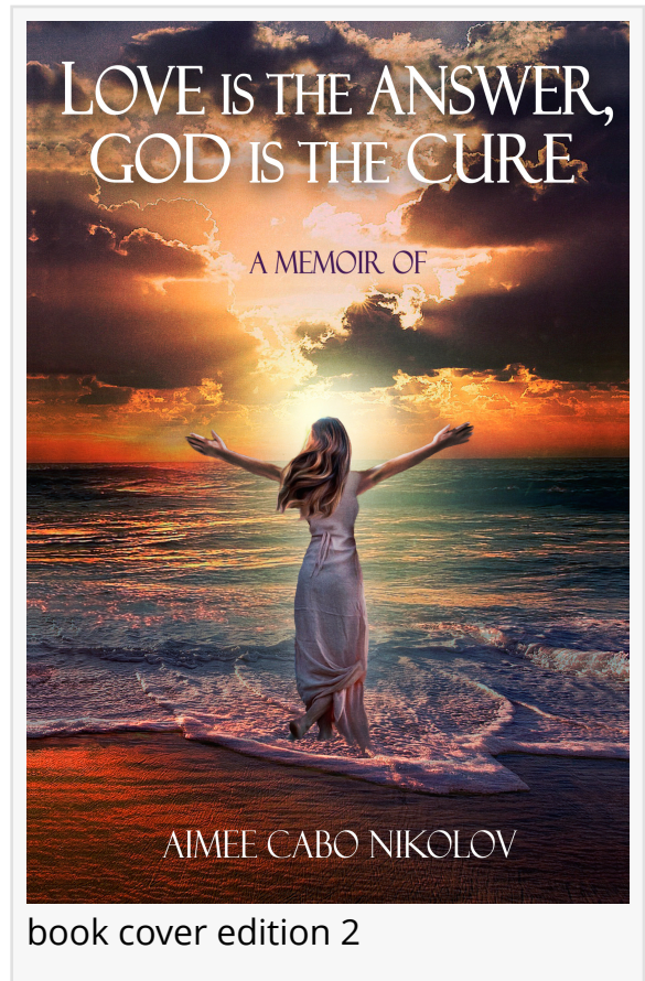
book cover edition 2