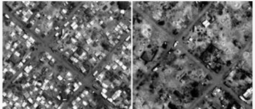
Before and After Massacred Tamil people in Mullivaikal in the last phase of the war

1. One important lie is that King Vijay was born to human female and a male animal lion. This