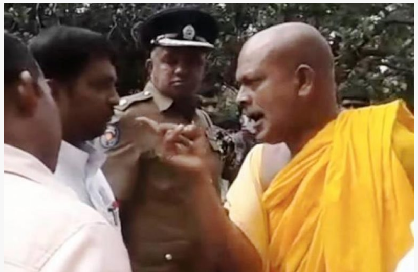
Buddhist Monk threatening to kill a Tamil