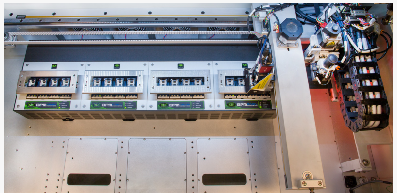
A view from the top of the 3910 with its 4 programming sites