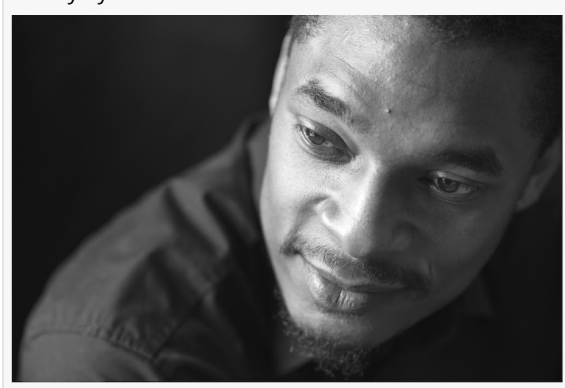
National Book Award winner at Poetry by the Sea

"Poetry by the Sea: A Global Conference" will be held May 21 through May 24 at the Mercy by the Sea Spiritual Retreat and Conference Center, a 33-acre sanctuary on the shores of Long Island Sound.