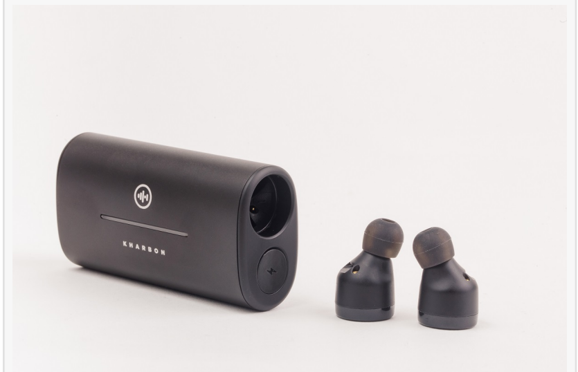
Ultra Compact & Sleek - Made with aircraft grade brushed aluminum