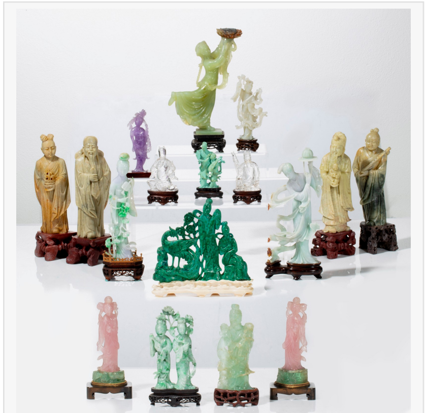
Collection of Chinese hardstone figural carvings (est. $1,000-$2,000).

Aileen Ward Andrew Jones Auctions +1 (213) 748-8008 email us here