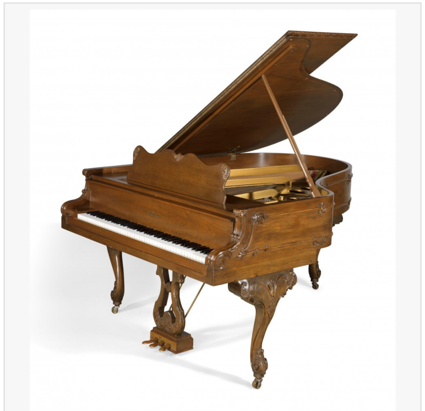
Steinway walnut reproducer player grand piano, Model OR, circa 1922 ($2,000-$3,000).

The April 6th Unreserved on Main Street auction will offer property from the same sources, all without reserve. Included will be period Biedermeier, modernist and industrial furniture, as well as paintings by Sydney Fossom, Malcom Myers, works on paper by Eva Gera, vintage Bakelite