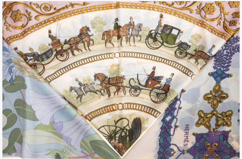
Hermes scarves: Two Hermes silk scarves and a shawl (est. $400-$600).