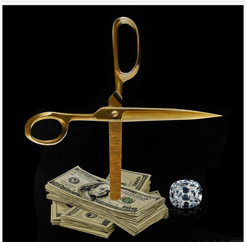
Robert Deyber, Rock, Paper, Scissors XI, acrylic on canvas, 72 x 72 inches

Martin Lawrence Galleries Modern Masters exhibition also offers visitors a unique opportunity to view Salvador Dalí's largest painting of all time, "March of Time Committee: Papillon, C. 1940's which is on permanent display among many other masterpieces. http://bit.ly/Modern Masters Vegas