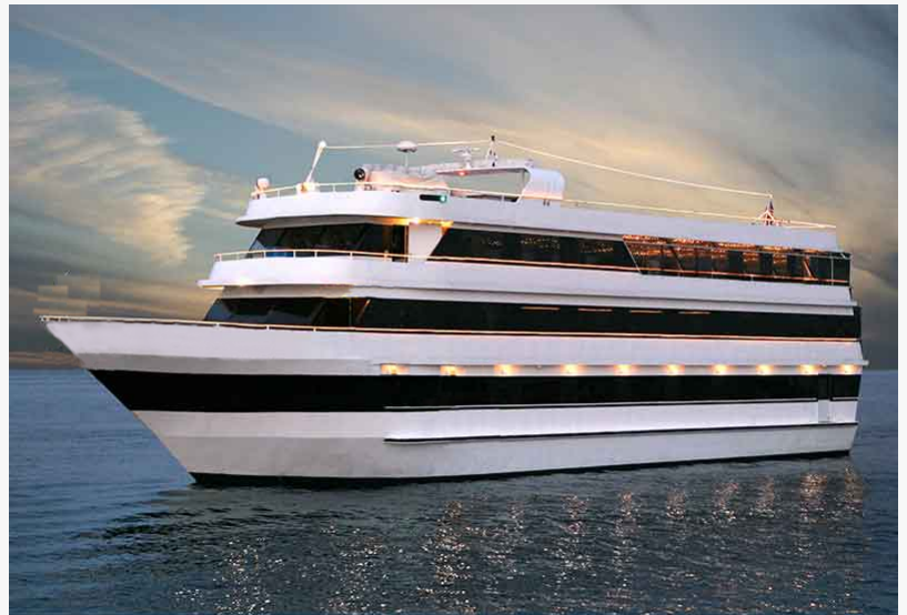
IFantaSea One / Inaugural Venue for Operation:Scrubs' National Nurses Symposium

This press release can be viewed online at: http://www.einpresswire.com