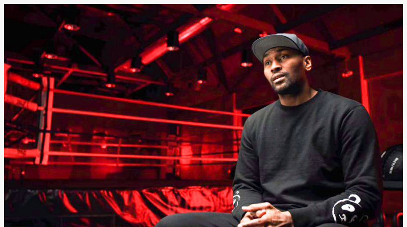
Ron Artest, who changed his name to Metta World Peace in 2011, shares his life story in a compelling documentary film.

ASTORIA , NEW YORK , UNITED STATES OF AMERICA, March 28, 2019 /EINPresswire.com/ -- A professional athlete who made a difference both on and off the basketball court is the subject of Quiet Storm: The Ron Artest Story . The East Coast premiere of this 2018 documentary film will be screened during the Ninth Queens World Film Festival (QWFF).