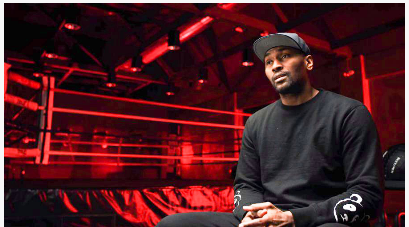
Ron Artest, who changed his name to Metta World Peace in 2011, shares his life story in a compelling documentary film.