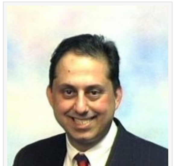
Guilty of malicious prosecution/abuse of process.