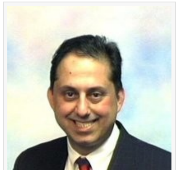
Guilty of malicious prosecution/abuse of process.