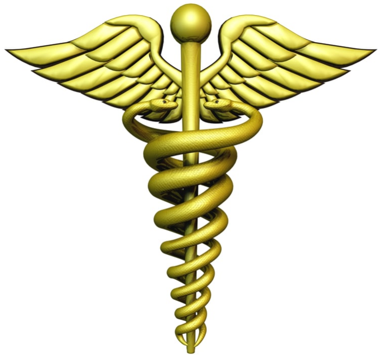
Guilty of malicious prosecution/abuse of process.