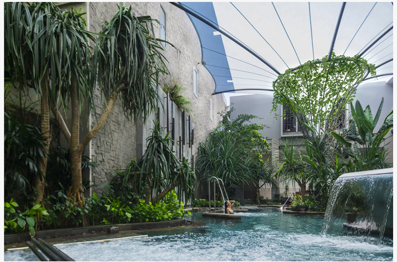
The Hydro Vital Pool