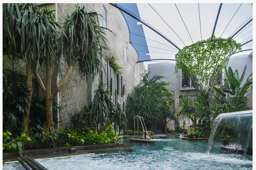
The Hydro Vital Pool

DENPASAR, BALI, INDONESIA, April 2, 2019 /EINPresswire.com/ -- An iconic design feature at The Ritz-Carlton, Bali, the Hydro Vital Pool is surrounded by lush foliage and takes its name from the Greek word for water and the Latin word for life to provide a unique and indulgent water healing experience. Pool Sessions are now available at 30 Minutes for IDR 288,000++, 60 Minutes for IDR 388,000++ and 90 Minutes for IDR 488,000++.