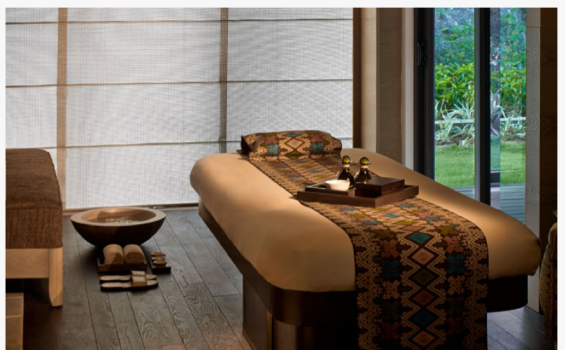
Single Treatment Room at The Ritz-Carlton, Spa

elegant tropical ambience. Featuring tranquil views over the azure waters of the Indian Ocean the resort has 279 spacious suites and 34 expansive best villas in Bali , providing the sheerest of contemporary Balinese luxury. Along the foreshore are The Ritz-Carlton Club®, six stylish dining venues, an indulgent and exotic marine-inspired Spa, and fun, recreational activities for children of all ages at Ritz Kids. A glamorous beachfront wedding chapel, makes an idyllic setting for destination weddings, while a range of outdoor