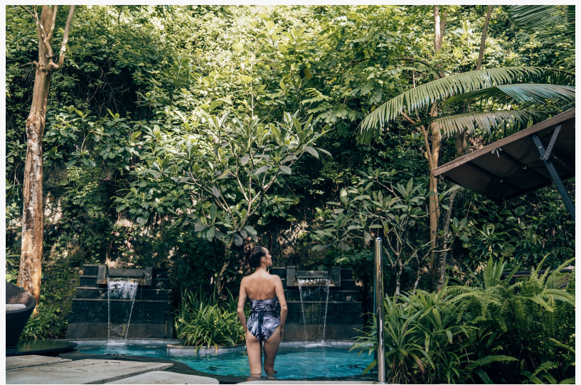
Indulge in Balinese Pool

Located on a stunning beachfront combining with a dramatic clifftop setting, The Ritz-Carlton, Bali is a luxurious resort offering an