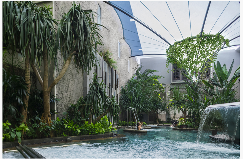
The Hydro Vital Pool