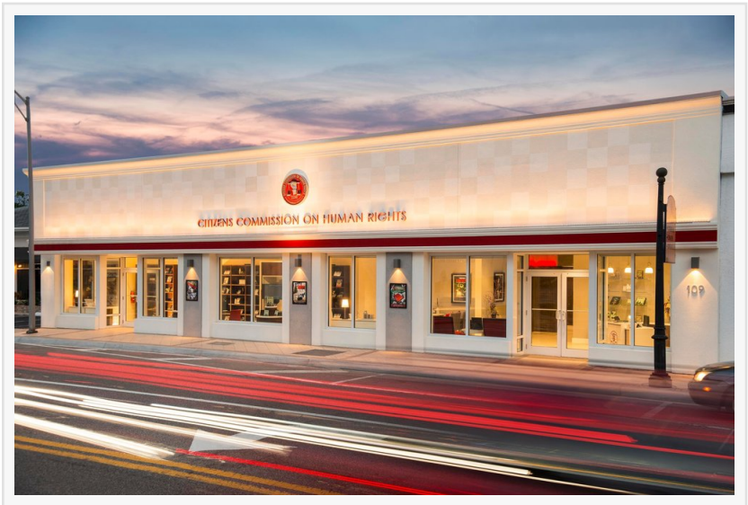
The headquarters for CCHR Florida are located in downtown Clearwater.