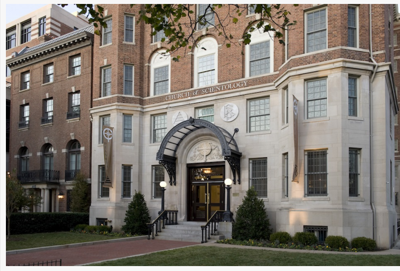
Founding Church of Scientology of Washington, D.C.

In Scientology, some upper levels of spiritual counseling require the parishioner's full-time participation for a period of several weeks in order for the person to achieve the full spiritual benefits of the religious service. Thus,