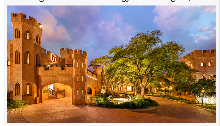
Courtyard of the Castle Kyalami religious retreat

the Church maintains religious retreats, away from everyday distractions. These retreats provide the ideal environment for advanced religious studies and spiritual counseling. While freedom from distraction is important during all counseling, it is vital at the most advanced levels. Castle Kyalami is that advanced religious retreat for all of Africa.