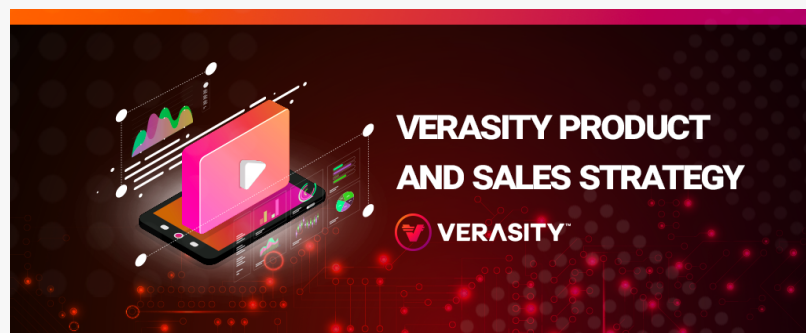
Veracity Product and Sales Strategy