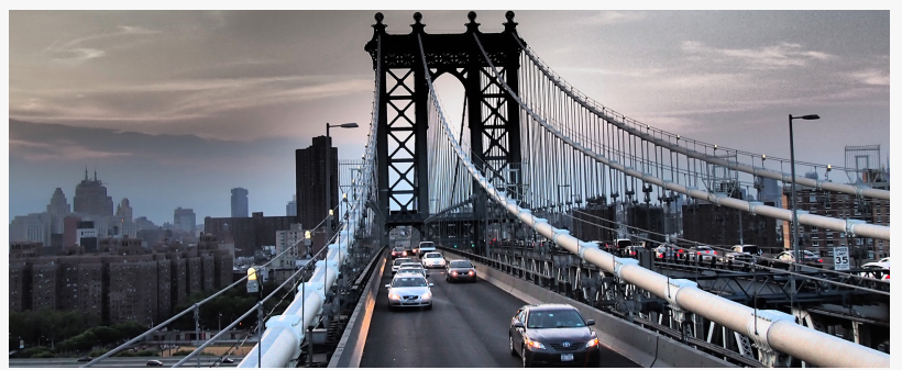
Friendly TLC - TLC car leasing

No ITIN: An individual taxpayer identification number (ITIN) is no substitute for an SSN.