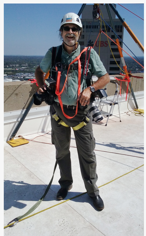
Robinson specializes in high-risk photography, involving images shot on top of big high-rise buildings with him in the safety gear.