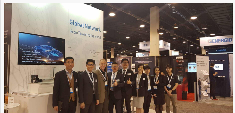
LITE-ON Industrial Automation Team

Founded in 1975, LITE-ON Technology has been known as a global leading opto-electronics component manufacturer. "This year, if you walk into LITE-ON's opto-electronics factories across the world, you will see the IIoT Gateway deployed at hundreds of work stations in thousands of production lines. Information from output target, present output, total achieving ratio to average utilization, idle or down time statistics is visualized and ready for further analysis to optimize