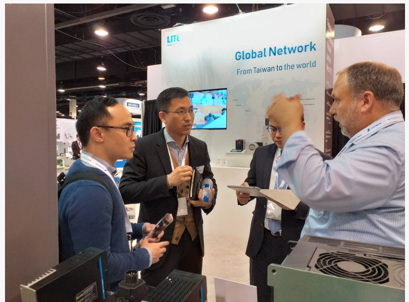
LITE-ON at Automate 2019