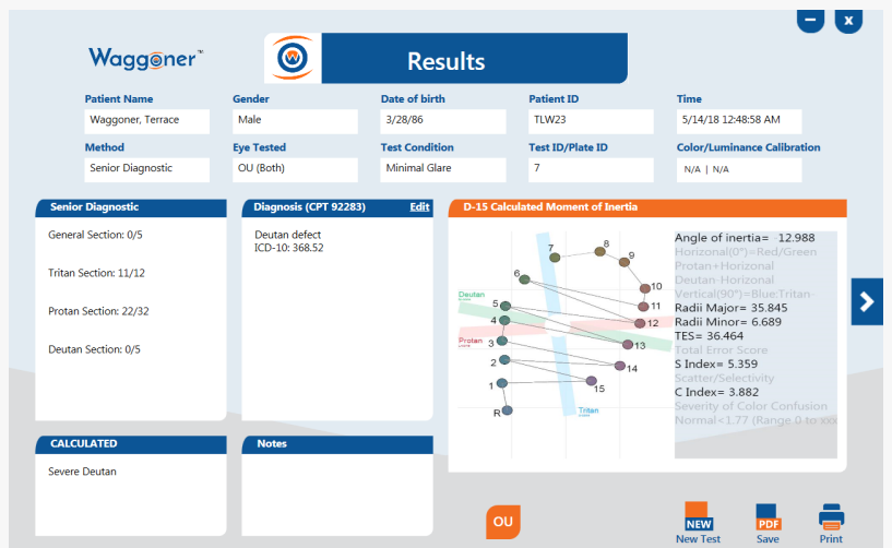
TestingColorVision.com Results Page