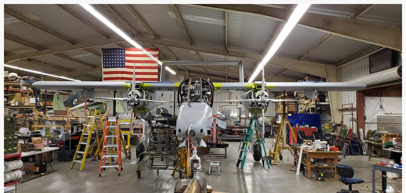
One of the historical OV-10 Broncos is being fully restored in Chino, CA

CHINO, CALIFORNIA, USA, April 12, 2019 /EINPresswire.com/ -- Chino, CA – Some of the fiercest pilots to come out of the Vietnam War reunited this week in Pensacola, FL to celebrate the 50th Anniversary of their formation. And they will soon be celebrating an entirely recommissioned squadron of the aircraft they made famous – The OV-10 Bronco. Backed by their propeller-driven Broncos, the Black Ponies were the go-to fighting force for close combat operations in Vietnam, supporting counter insurgency forces of all stripes, including the Navy SEALs.