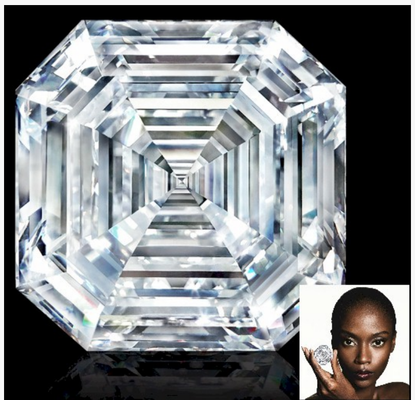
Image of the world's largest square emerald cut diamond, the Graff Lesedi La Rona.

NEW YORK, NY, UNITED STATES, April 13, 2019 /EINPresswire.com/ -- London-based Graff Diamonds Limited, the luxury jeweler, unveiled its latest big diamond creation, the 302.37-carat D-color "Graff Lesedi La Rona," a high-clarity stone considered as the world's largest square emerald cut diamond. Graff states it is the "largest highest clarity, highest color diamond ever graded by the Gemological Institute of America (GIA)." Diamond dealer and founder of Graff Diamonds, Laurence Graff, who is responsible for cutting and polishing a majority of the 20 largest diamonds discovered this century, is responsible for this latest creation. The gem's D color grade (meaning colorless) is the highest end of the GIA color scale, a rarity for any diamond to achieve, much less one of more than 300 carats. All great diamonds start with their discovery, something everyone can participate in through a quality junior mining diamond exploration company. Further below is a brief overview of Arctic Star Exploration Corp. (TSX-V: ADD) (F: 82A1) (US Listing: ASDZF), currently engaged in one of the most exciting programs in the diamond