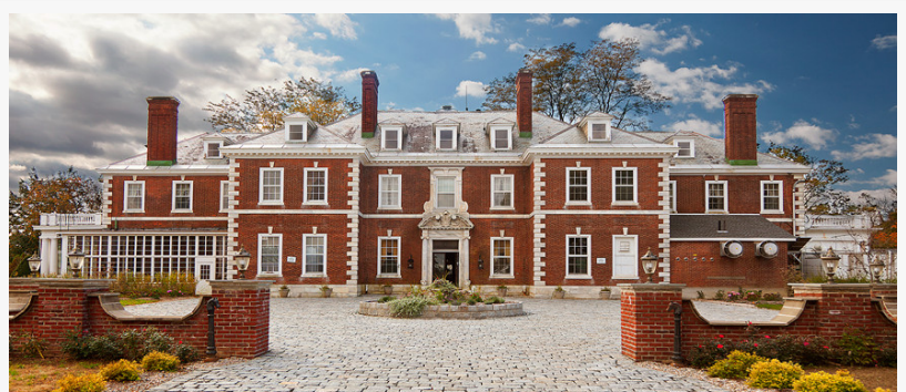
Totally renovated nostalgic Berkshire Summer Cottage

LENOX,, MA, US, April 14, 2019 /EINPresswire.com/ -- World Taichi Day at Eastover , in Lenox Mass.