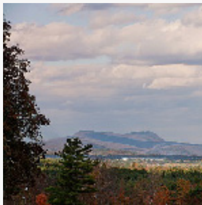
Beautiful Scenic Views