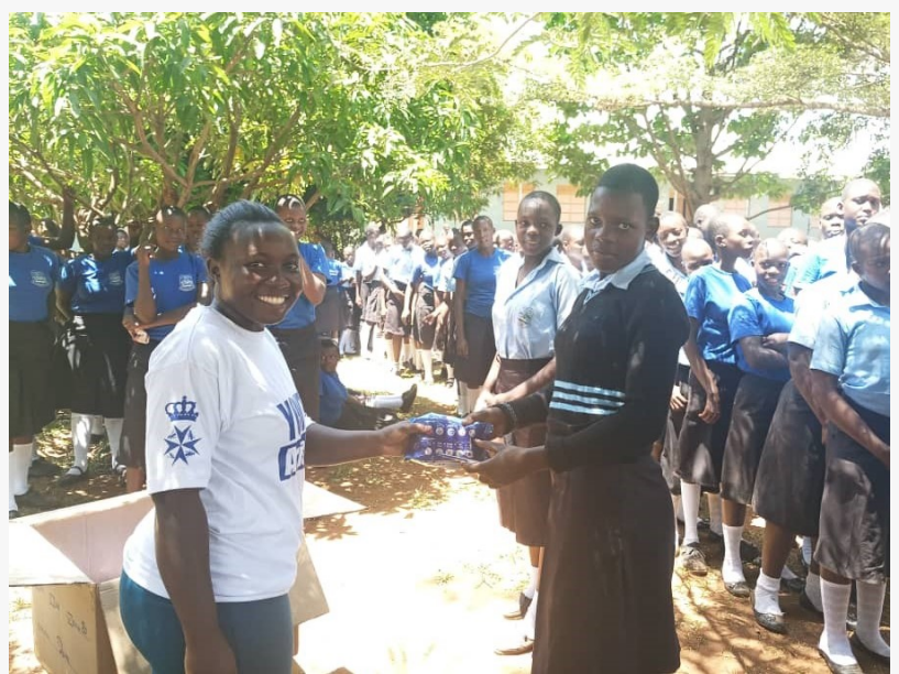
Girls Arise Uganda receiving shipment