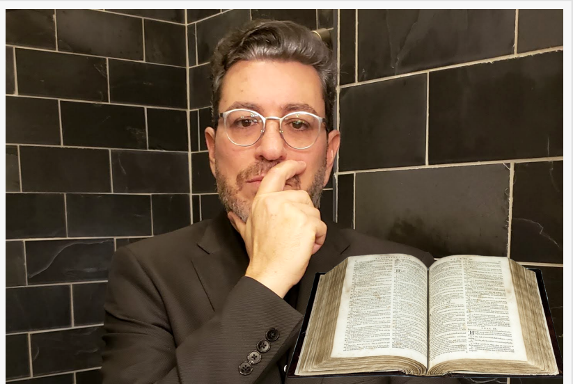
HOLY LAND MAN