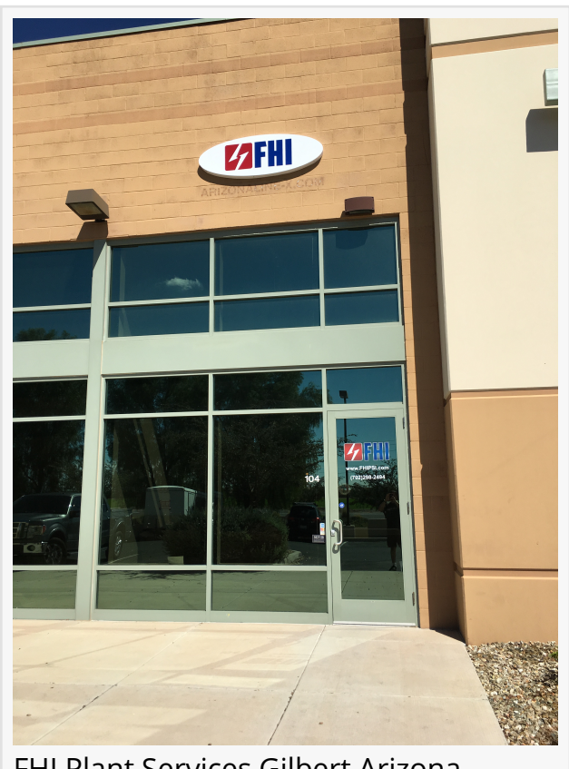
FHI Plant Services Gilbert Arizona Location

FHI provides new boiler installation in addition to ASME industrial boiler repair, pressure vessel installation and repair, B31.3 process piping, as well as B31.1 Sec I boiler and non-boiler external piping. We handle American Petroleum Institute API 653 Tank Repair and API 1104 piping code projects. Having a National Board "R" Stamp and ASME "S" Stamp, FHI is gualified to perform specialized repair