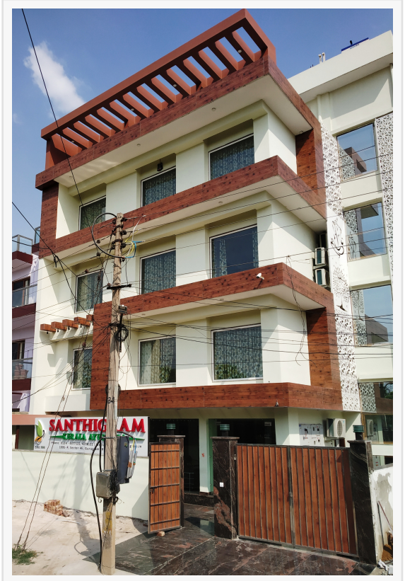
Santhigram Kerala Ayurvedic Hospital

Santhigram Kerala Ayurvedic Company Limited has proudly announced the opening of its Premium Ayurvedic Hospital at Gurugram, NCR (National Capital Region), Delhi, India in line with its goal of making Keralaspecific Ayurvedic and Panchakarma Treatments easily accessible to patients in different parts of India and through its subsidiary in the United States. The hospital has premium facilities for the comfortable stay for the