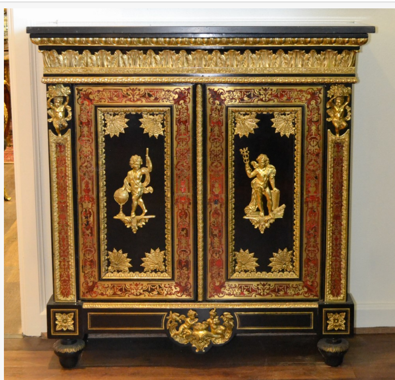
Antique French boule credenza, museum-quality, in immaculate condition, with the two doors featuring symbolic cherub images, 47 inches in height by 44 inches wide (est. $6,000-$8,000).