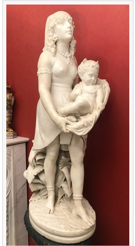
Highly detailed Carrara marble grouping of Pharaoh's daughter holding the infant Moses in a blanketed basket by the 19th century Italian sculptor Biggi Fausto, signed (est. $6,000-$15,000).

This press release can be viewed online at: http://www.einpresswire.com