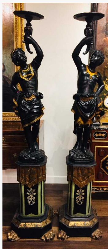
Large antique pair of Italian carved and lacquered blackamoor figures, of a man and a woman dressed in ceremonial garb with gold-gilt trim and accents, 75 inches tall (est. $4,000-$8,000).