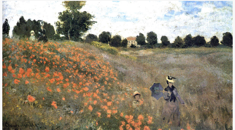
White Settlement Texas Local Real Estate Agent