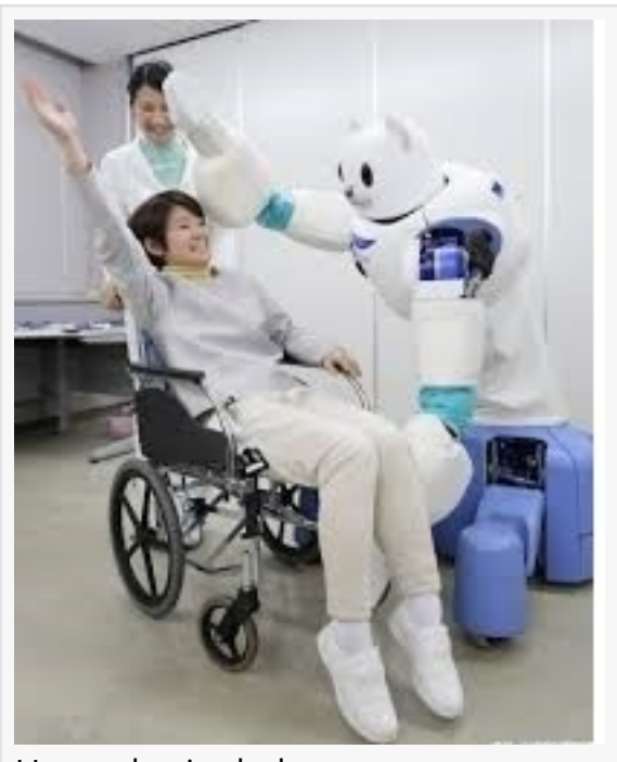
How robotics help