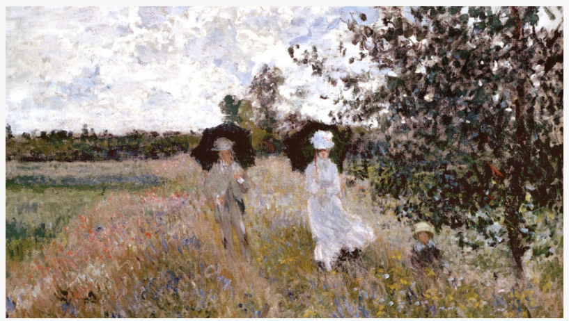
Top Local Real Estate Agent Cypress TX

A knowledgeable agent could have more insight, but a newer agent may have cutting-edge state-of-the-art marketing suggestions, and more enthusiasm and also time which could result in getting your house marketed more promptly.