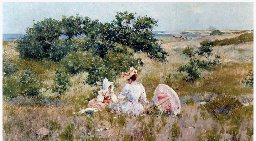
Best Real Estate Agents Cypress Texas