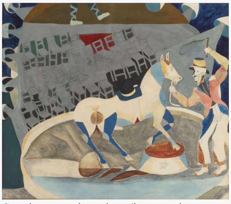
Gouache, watercolor and pencil on paper by Francesco Toledo (Mexican, b. 1940), titled En el Circo (circa 1970), signed 'Toledo' lower left and titled on verso (est. $18,000-$22,000).

This press release can be viewed online at: http://www.einpresswire.com