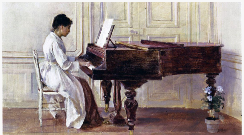
Best Real Estate Agents Sugar Land Texas