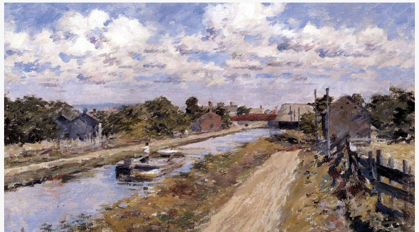
Best Real Estate Agents Highland Village Texas