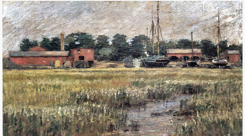
Highland Village Texas Local Real Estate Agent